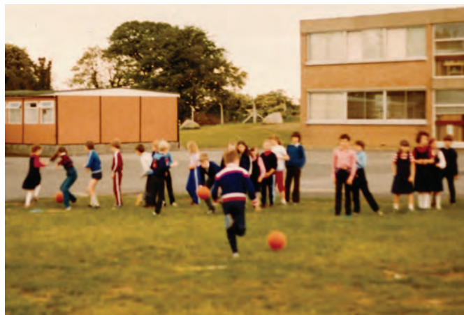
Where It Began - Photograph shows portion of St Olaf's Primary School where the first club meetings were held, as well as the prefabs that were subsequently used as meeting rooms and dressing rooms.

The club's first AGM was held in Queen of Angels' School Hall at 8pm on Thursday 26th November 1981. The following is recorded in the minutes of that meeting: