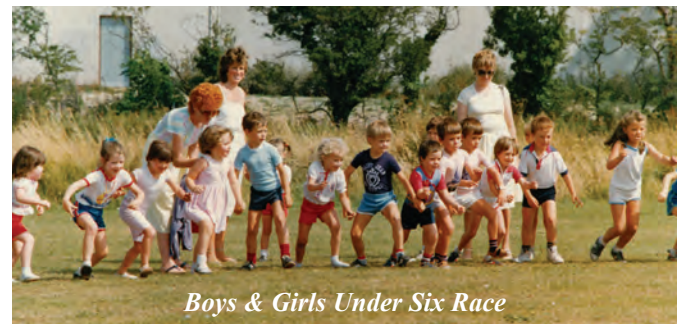
Boys & Girls Under Six Race

In the under-10 Hurling the boys in Maroon (Galway) beat the boys in Blue (Dublin) by 3-0 to 1-0.