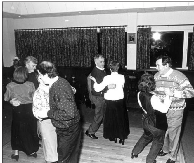
A group of the club's set dancers in action on a Friday night in 1994.