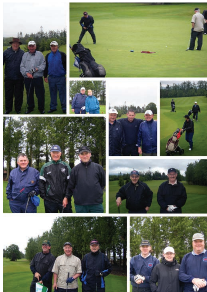
Captain's Day 2008 Montage.