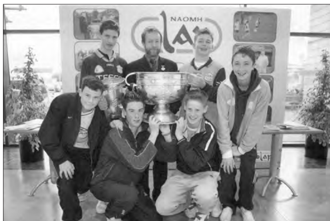
Seán Kelly, GAA Presiden at the Dundrum Town Centre, on the same occasion, with juvenile members of Naomh Olaf G.A.A Club.